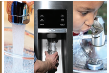
Tap | Fridge | Fountain

A growing number of businesses are turning to bottleless drinking water systems for their advanced filtration capabilities, providing purified, healthy, and unlimited drinking water.